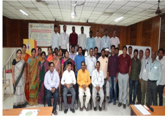
Two week AICTE sponsored FDP on GREEN AND SUSTAINABLE TECHNOLOGIES FOR MATERIALS from 10.06.2019 to 22.06.2019