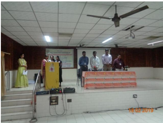
One week Faculty Development Programme on “ Fatigue Failure of Engineering Materials ” from 18.02.2019 to 23.02.2019