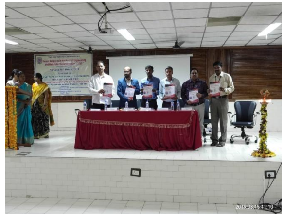
Two day National Conference on RECENT ADVANCES IN MECHANICAL ENGINEERING AND MATERIAL CHARACTERIZATION (NCRAMEMC-2019) on 15.03.2019 and 16.03.2019